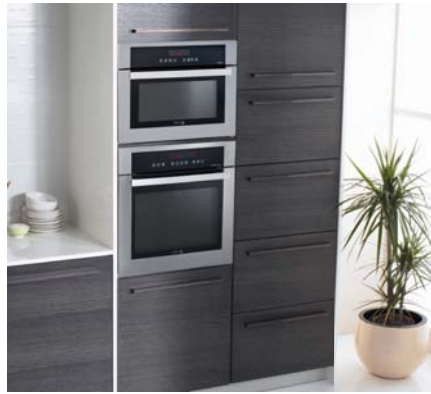
FSO1700X with 6H-570ATCX Microwave Combination Oven